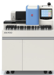
AIA-900 Loader Model 90 Tests Per Hour