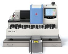
AIA-900 Benchtop 90 Tests Per Hour